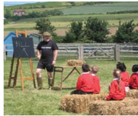
View the clip on the front page of www.face-online.org.uk

people to find it, pass it on and engage with the issues. "My great aim is simply that kids will ask questions and want to find out more about where their food comes from," he says. "And if kids will see it and want to go out to the countryside, or visit a farm and go and pester their parents or their school to take them on a farm trip then that would be fantastic for me; that would be job done."