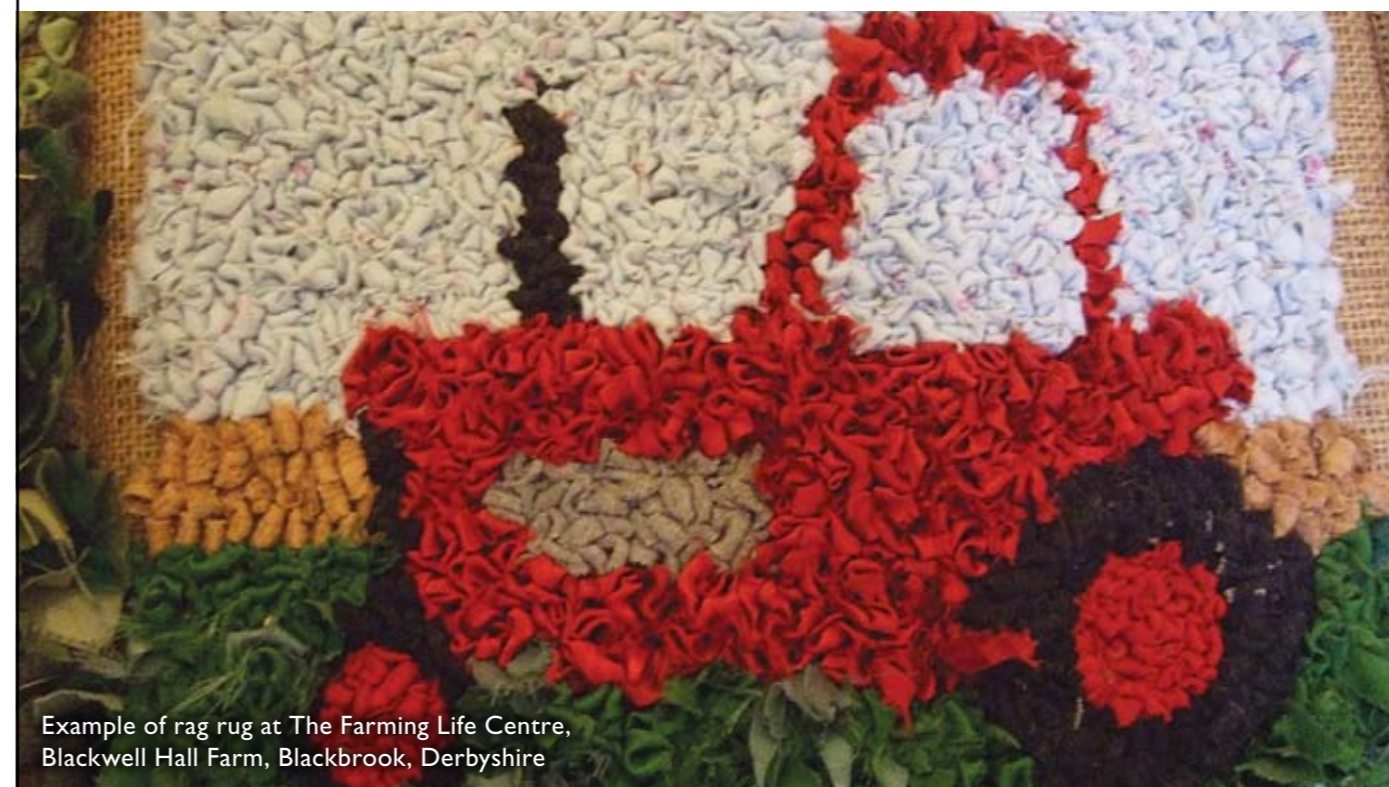
Example of rag rug at The Farming Life Centre, Blackwell Hall Farm, Blackbrook, Derbyshire

This food citizenship framework emphasises the importance of helping shape the relationship between the individual, the food they eat, how it is produced and the way in which the land is managed. Get this right and we may have made progress.