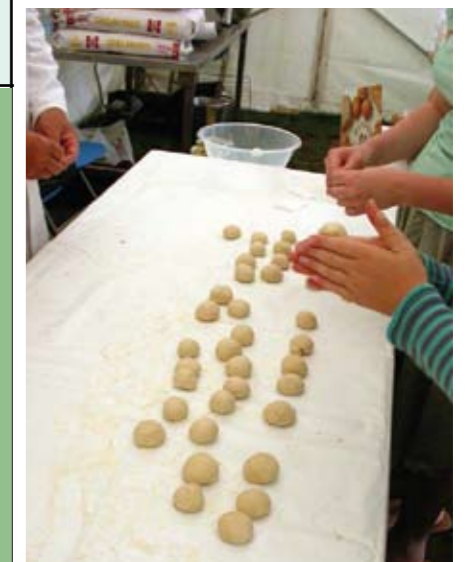
The picture shows children shaping bread dough on the RNAA 'Over the Farmers' Hedge' stand.

Comments from schools included: "It was a superb day; the trails gave the day a focus and purpose which added to the enjoyment of all."